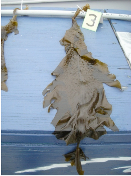
Figure 1. The Asian kelp Undaria pinnatifida attached to an experimental rack.