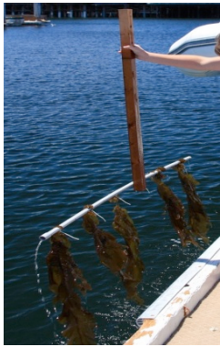
Figure 2. One of the racks with samples Undaria pinnatifida attached.

A one-meter piece of lumber (2 inch by 2 inch pine) served as the main axis for each rack. A 1.9 m long PVC pipe was screwed onto the main axis, creating a T shape (Figure 2).